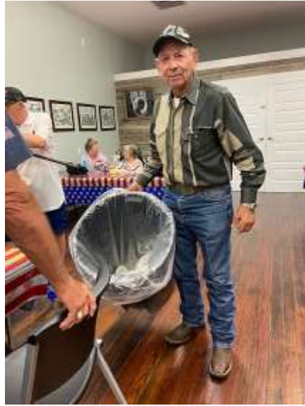
Cowboy the “Can Man”