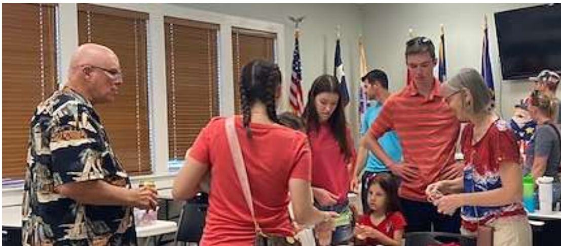
VVA 920 – 4 th of July