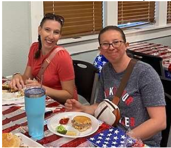
VVA 920 – 4 th of July