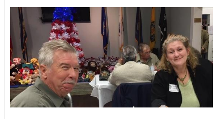
2018 Christmas Party