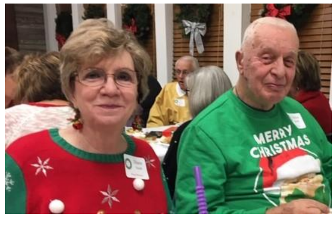
2018 Christmas Party