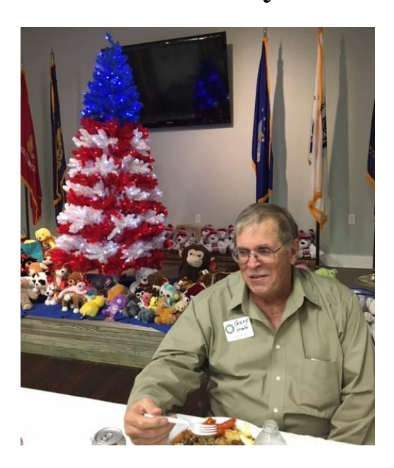
THANK YOU! For a successful Stuffed Animal drive. Denton County children appreciate your generosity.