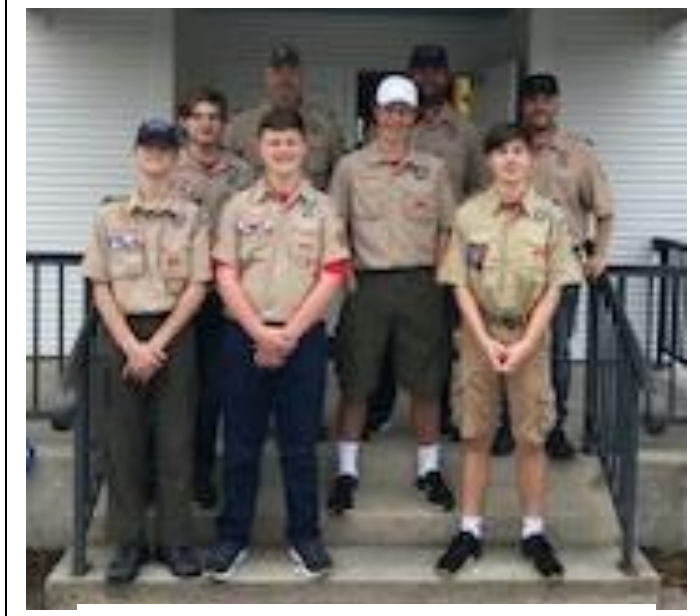
BSA Troop 1656 was enroute to Camp Filmont in New Mexico.