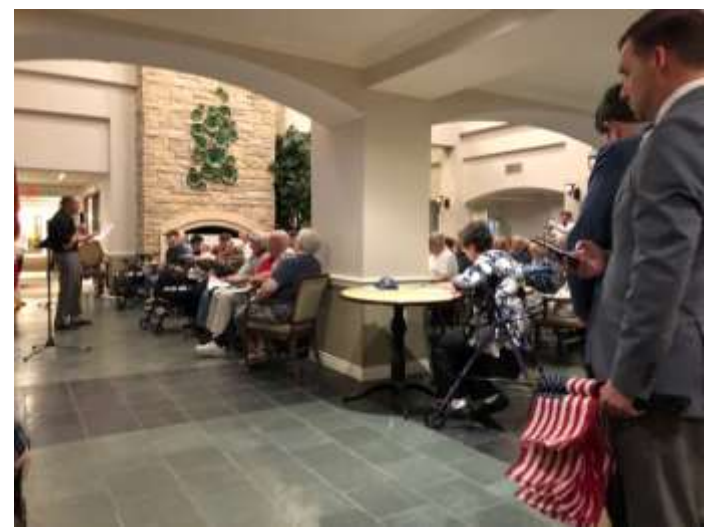
Each Veteran received a Flag