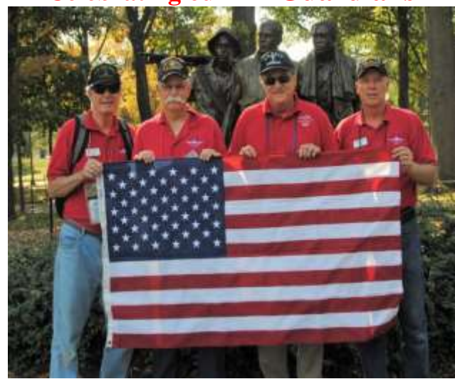
Honor Flight #16 - October 2016