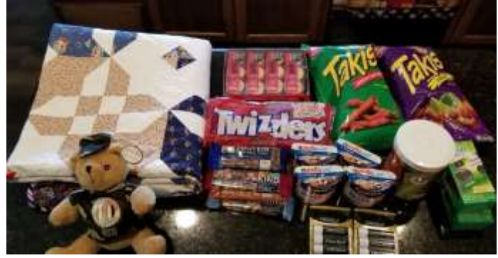
Quilt provided by Denton Quilt Guild.