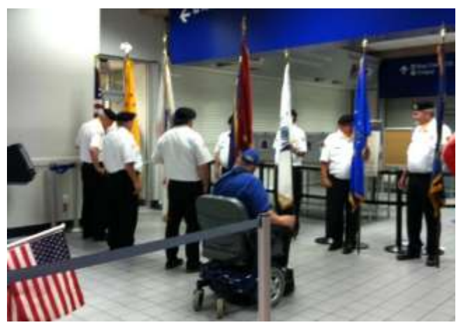
VVA Honor Guard May 2013