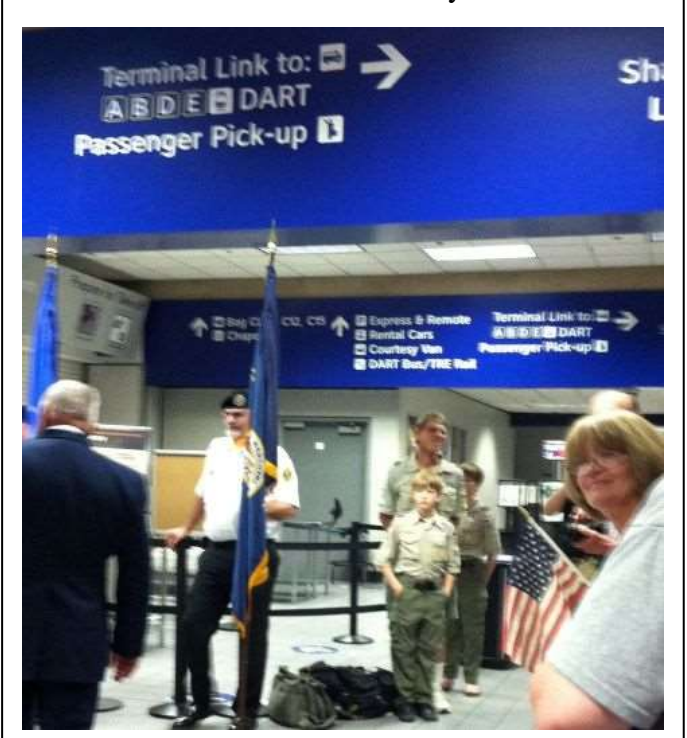
Boy Scouts Honor WWII Veterans