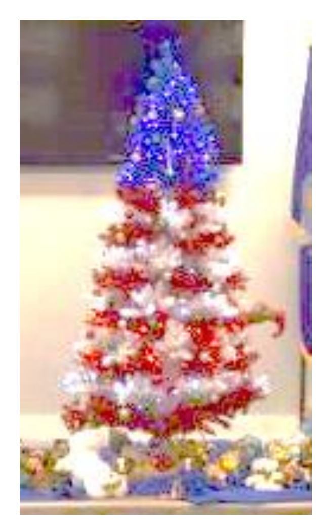
Wishing you a Merry Christmas!