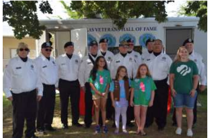
Girl Scouts raised the Flag.