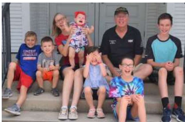
Family makes our celebration complete.