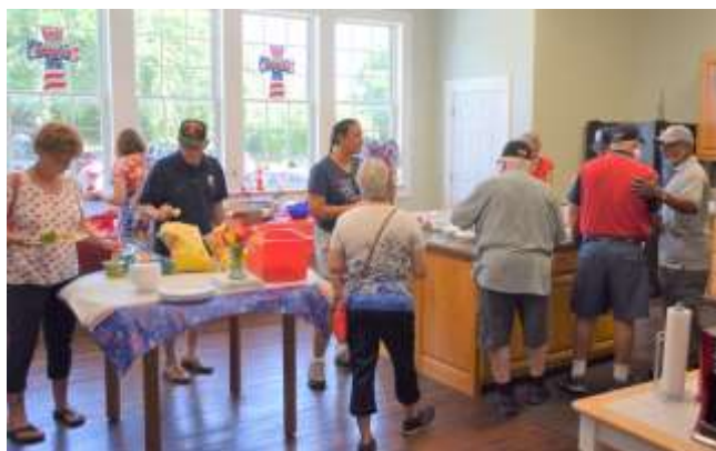
Sides & Desserts were Plentiful & Delicious!