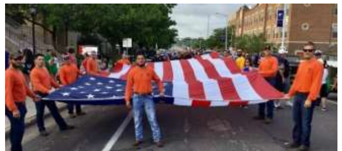
Frenchy’s Flag & Crew