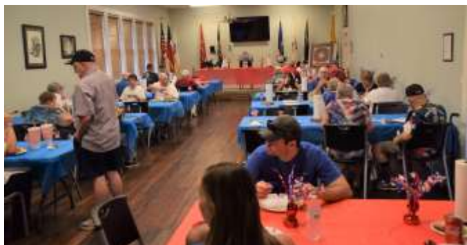
When we Meet – We EAT!