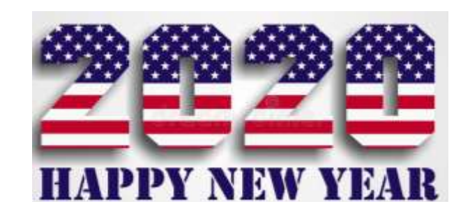
Veterans Court 12-19-19