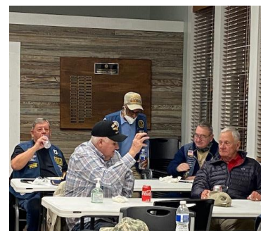
Camaraderie - "When We Meet, We Eat!"