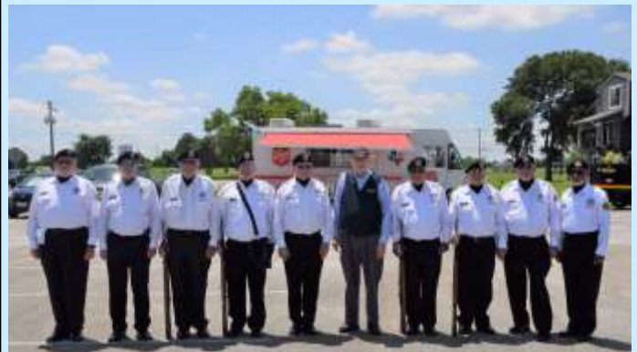
The Wall That Heals May 2019