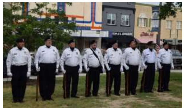
Memorial Day 5-27-19

"Never Again Will One Generation of Veterans Abandon Another"