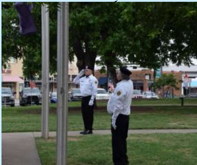
Memorial Day 2019