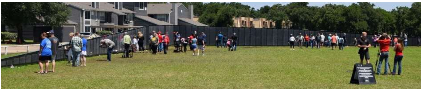
The Wall That Heals