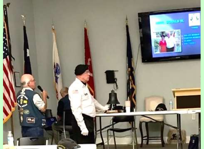
44 Deceased Members honored