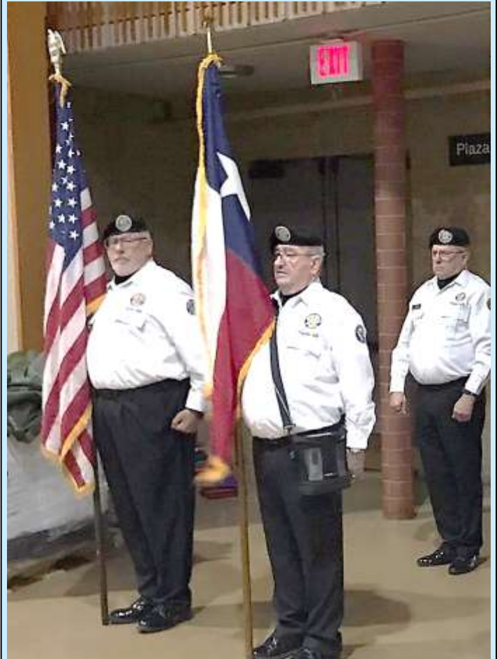
Denton County Stand Down 10-24-19