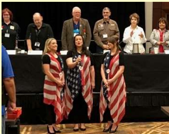
Ladies of Liberty entertained