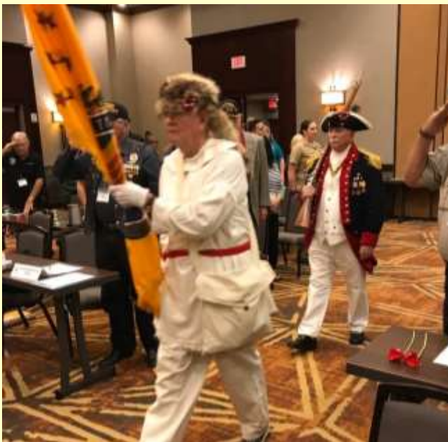
S.A.R. Presented Colors