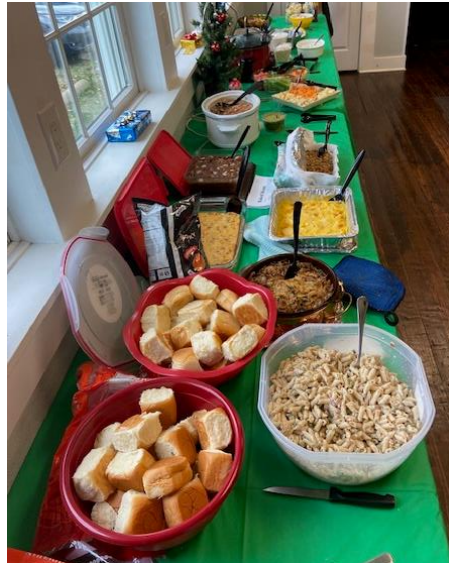
Thank YOU Members for bring Sides & Desserts!