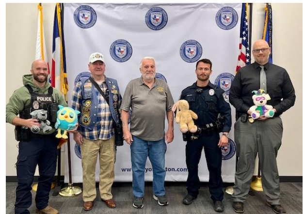
Stuffed Animal Donation to Denton Sheriff's Dept. Nov 26, 2024.