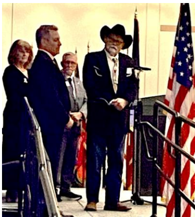
TVHOF Annual Awards Nov 16, 2025